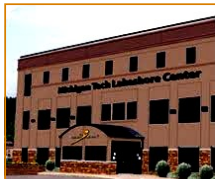
Michigan Tech Lakeshore Center along the Portage Lake Shipping Canal.